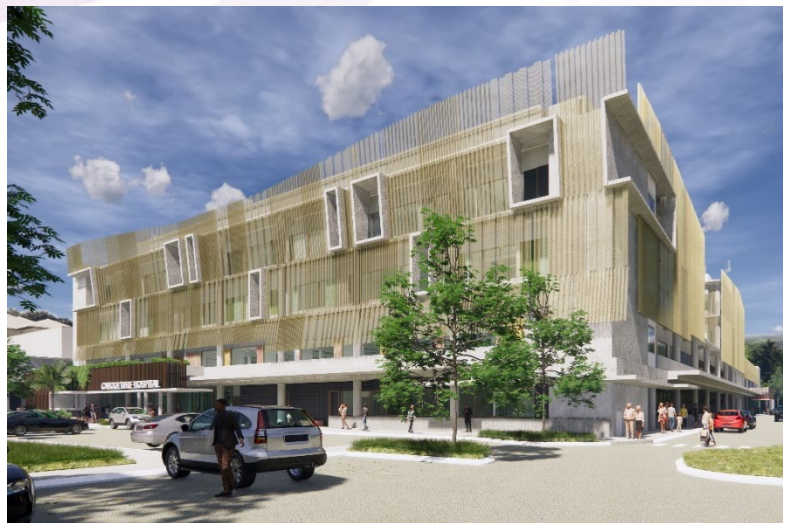
Image: New five storey Clinical Services Building

Over the next four years, Caboolture Hospital will undergo a major expansion and redevelopment with a clear focus on building capacity and modernising health care services.